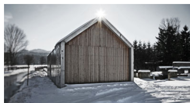
small hydro power plant Fuschler Ache, Thalgau 2011