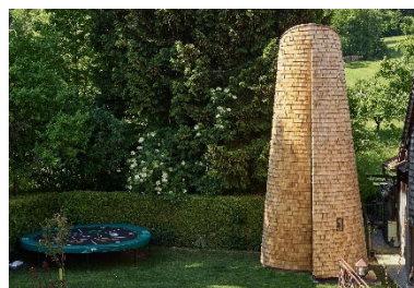
chapel of mercy Ried am Wolfgangsee 2018