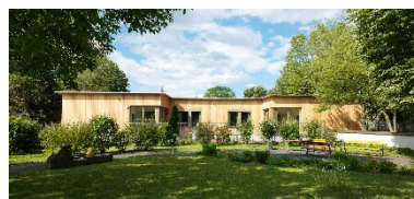
hospital II Graz south-west, location south, Graz 2020