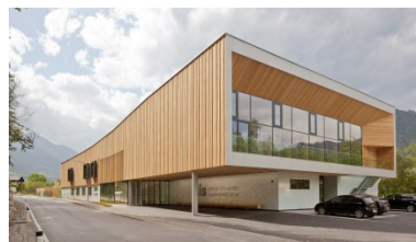
centre for special education, St. Johann im Pongau 2015