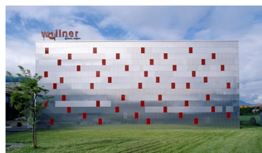
warehouse „Wallner“, Scheifling 2005