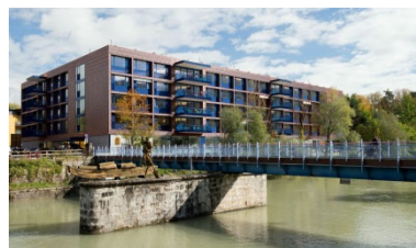
retirement home, Hallein 2013