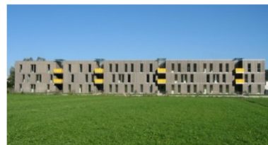
housing estate „Samer Mösl“, Salzburg 2006