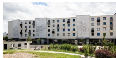
housing estate and daycare centre „Grüne Mitte“, Linz 2016