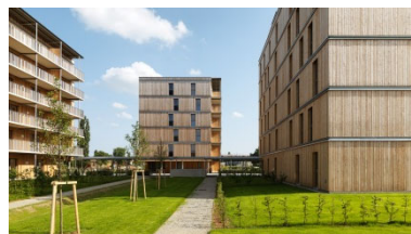
housing estate „Hummelkaserne“, Graz 2016