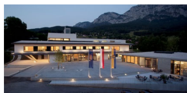
community centre Steinbach am Attersee 2012