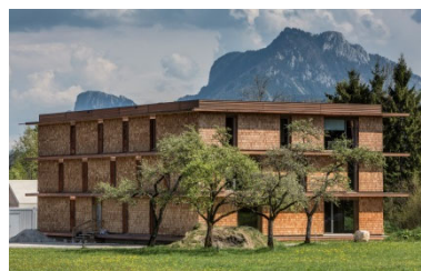
culturepowerplant oh456, Thalgau 2014